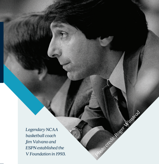
Legendary NCAA basketball coach Jim Valvano and ESPN established the V Foundation in 1993.

One in two men and one in three women in the U.S. will be diagnosed with cancer in their lifetime. Delta Chi Fraternity and the V Foundation for Cancer Research are working together to achieve Victory Over Cancer®.